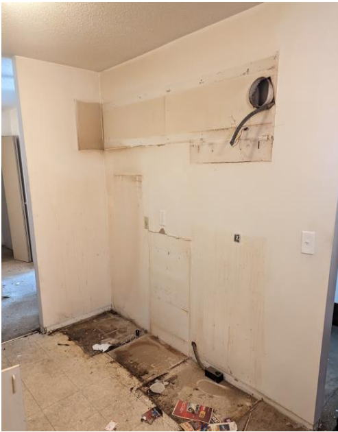
Lake Grace: Kitchen Rehab Before